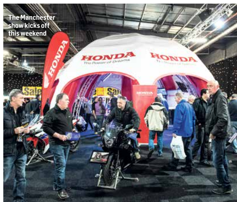
The Manchester show kicks off this weekend

The Manchester Bike Show returns for a sixth year and 2017 should be the biggest and best yet. This year there will be hundreds of new bikes from the likes of Suzuki, Honda, Kawasaki, KTM, Yamaha, Triumph, Ducati, Harley-Davidson, Benelli and CCM. We say This year should be extra special as Hall 3 hosts the Northern Classic Bike Show, featuring over 750 classics, customs and one-off specials from clubs and individuals.