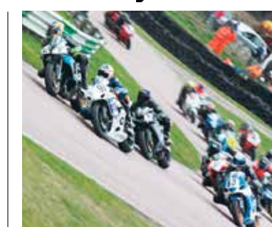
Get yourself down to Kent this weekend

An open track day where any bike is permitted. Do be aware that there is a 100dB noise limit in place that could catch out those with really aftermarket fruity exhausts. We say Lydden Hill has many claims to fame including being the site of the invention of Rallycross along with being the UK's shortest road racing circuit. Legend has it that when it was